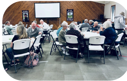
Fellowship after church