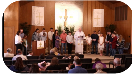
5 th Graders First Communion