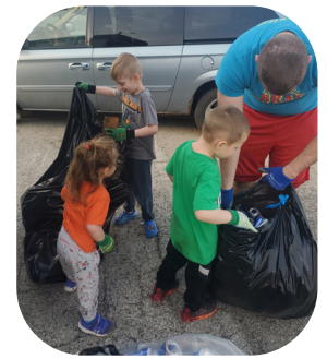
Can trailer helpers