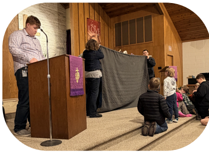
Good Friday Puppet Show