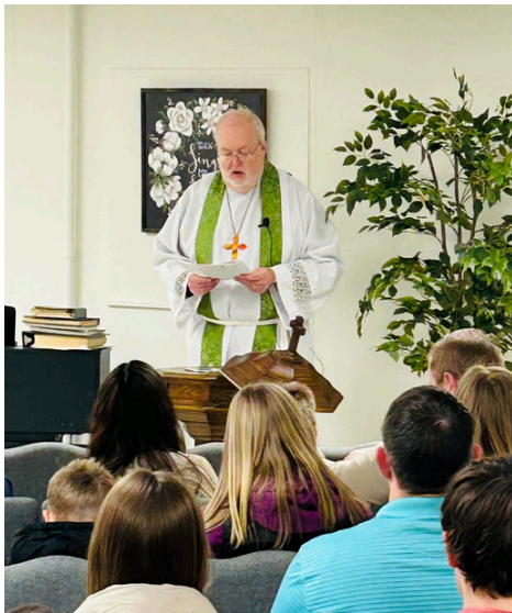
A blessing of the baptismal font was held on Sunday, February 23rd.