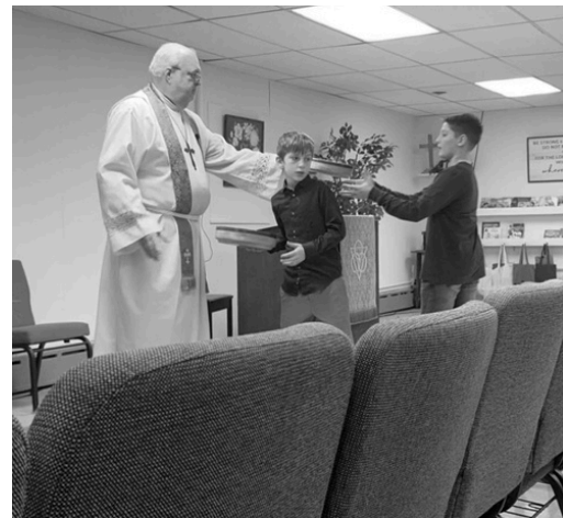
Our youth love serving as ushers!