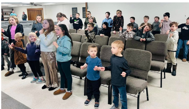
Our youth singing praises to God on Sunday mornings!